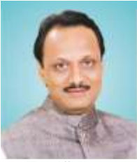
Hon. Ajit Pawar President PDEA Dep. Chief Minister, Maharashtra