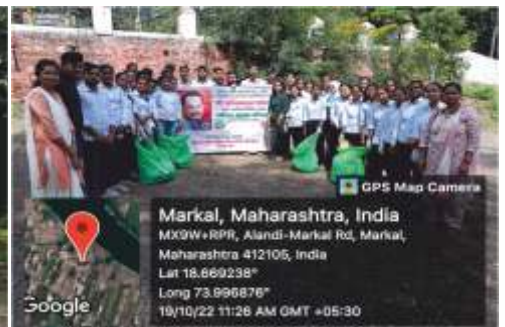
Plastic collection done by NSS team at Dharmvir Chatrapati Sambhaji Maharaj Samadhi Sthal Tulapur on 19 th October 2022

'Prevent Pollution, Protect Nature...!!!'