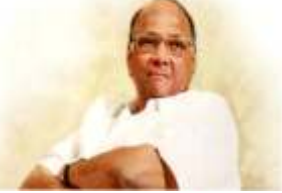
Padmavibhushan Hon. Sharadchandraji Pawar Ex. Union Cabinet Minister Agriculture & Food Processing Industries Government of India