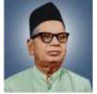
Late. Hon. Baburaoji Gholap