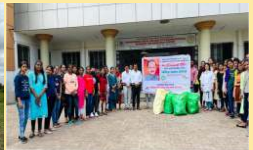
Plastic Collection Drive Under Swachh Bharat Abhiyan At College Campus