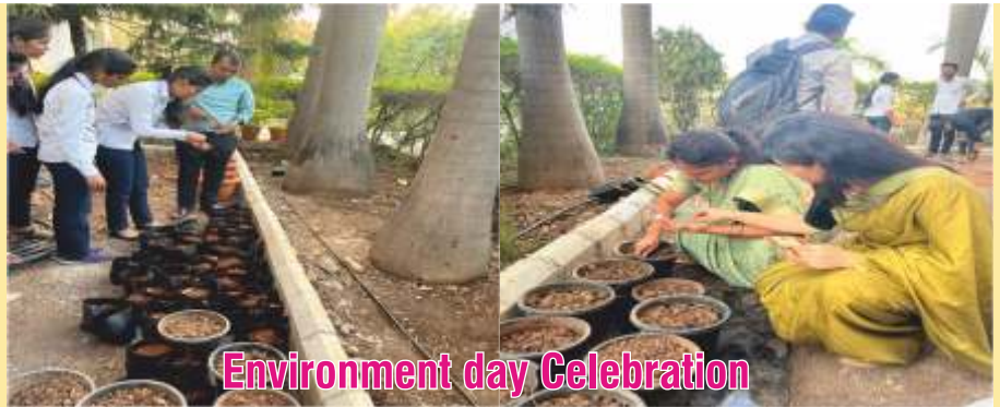
Environment day Celebration

The Environment day Celebrated on 6 th June 2023 at college Campus the NSS volunteers Planted the Various types of the Seeds in the college garden.